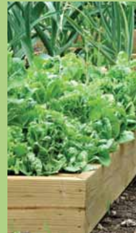
Related Products: 14, 16, 19, 21, 26

Whether you go natural or use chemicals in your veg patch, be sure to provide an ample supply of nutrients to stimulate healthy growth. Your fruit, vegetables and ornamentals will be enhanced by Tui Nitrophoska Blue fertiliser. Its compound form is easy to use and is a concentrated source of nutrients. Tui Superphosphate is an excellent source of phosphorus, which is responsible for stimulating root growth and especially important as NZ soils are naturally phosphorus deficient. Tui Sulphate of Ammonia will intensify leaf colour and growth rate in plants, especially beneficial for cabbages and lettuces. To grow a high yield of tasty fresh potatoes use Tui Potato Food.