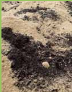
Related Products: 2, 10, 11

All plants need feeding to reach their optimum growing potential. Tui Blood & Bone provides a natural, organic fertiliser that is slow acting and long lasting. Tui General Fertiliser has been formulated with an NPK of 6-5-5 to supply all the vital nutrients essential for healthy growth. Tui Eco-Fert is a natural seaweed based fertiliser that can be applied as a foliar spray or soil drench to vegetables, ornamental plants and lawns.