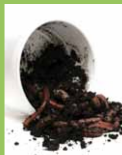
Related Products: 15, 22, 25

Soil is the foundation of all healthy gardens. Create a soil base with plenty of organic matter to encourage healthy growth, earthworm activity and provide plants throughout the garden with the nutrients they need to thrive. Use Tui Super Sheep Pellets to improve soil condition and add nutrients to the whole garden. Mulch around the garden with Tui Pea Straw Pelletised Mulch to conserve moisture, enrich and protect the soil. Clay or compacted soils will benefit from added Gypsum to loosen up the soil, improving root growth and drainage.