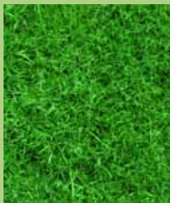
Related Products: 12, 13

Keep your lawns thick, lush and healthy to prevent weeds from establishing. Tui Lawn Fertiliser contains the essential nutrients to aid in establishing and maintaining root growth, which is the foundation of a lawn. Tui Lawn Fertiliser also has the added benefit of sulphate of iron to help control moss. To enhance the deep colour of lawns apply Tui Nitrogen Booster Urea. This fast acting form of nitrogen also encourages rapid growth.